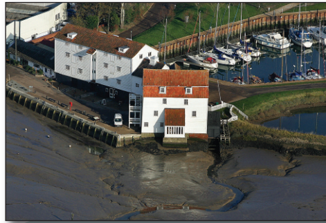
Woodbridge Tide Mill