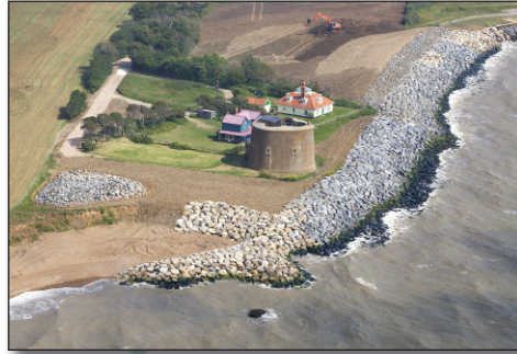
Martello Tower at Bawsey East Lane Point